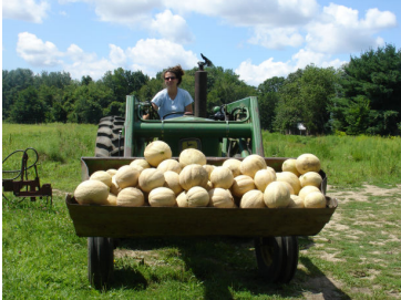
Transporting the melons.