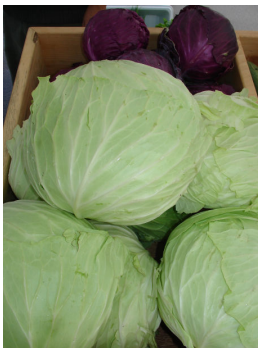
Red & Green Cabbage