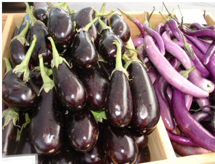
Italian & Asian Eggplant