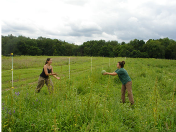
Harvesting the melons out in the field.

Many members have requested recipes, so we will be e-mailing those out soon. If anyone wants to provide a recipe for the CSA, please feel free to e-mail me the recipe and we can distribute it through our newsletters as well as print out a copy to have at the CSA pick-ups.